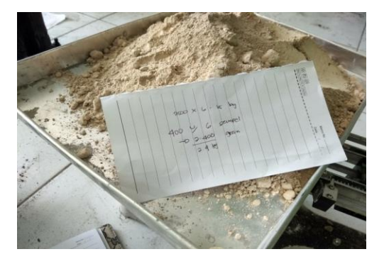
Figure 4. Zeolite Added Material Weighing Process