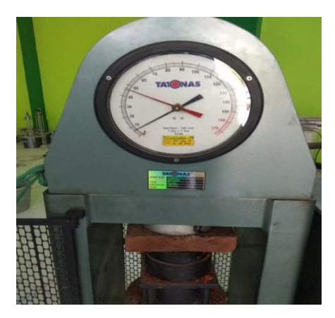
Figure 6. Testing the Compressive Strength of Red Bricks