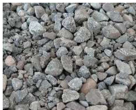
Figure 23. Aggregate Weighing After Abrasion Test