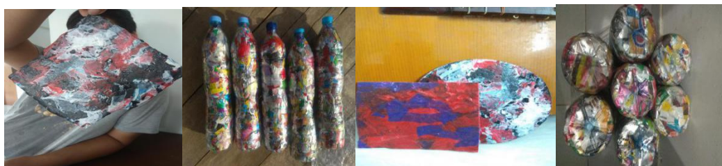
Figure 1: Ecobrick and Proskaf Marble

Likewise, this also happened to young people in Bengkayang Regency, as an area with foremost, outermost, and underdeveloped status, they must have a deeper understanding of entrepreneurship and the processes that must be followed. This research is ongoing because in the process of entrepreneurship, especially in creating products there will be many challenges going forward, especially in terms of brand or product introduction to the public or consumers. The below table 3 discusses the results of the FGD, namely the Determinant Variable of young people's interest in waste plastics management to become a valuable product, namely Ecobriks and Marble Proskaf. Picture 1 below is the example of ecobrik results and marble proskaf from plastic waste and plastic bottle :