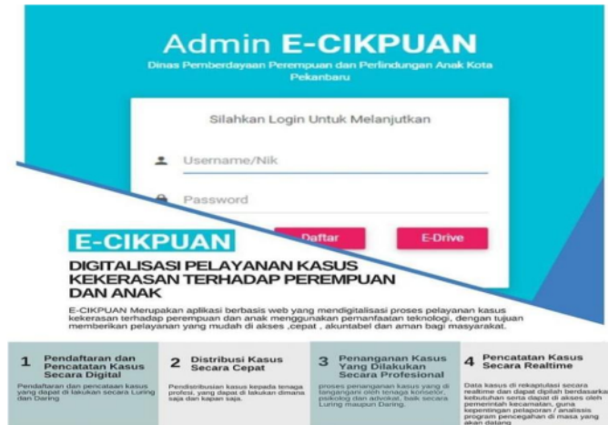
Figure 5. E-Cikpuan Digital Services

Protection (UPT PAA) Pekanbaru City. E-Cikpuan is here as an innovation from the Pekanbaru government for internal data processing.