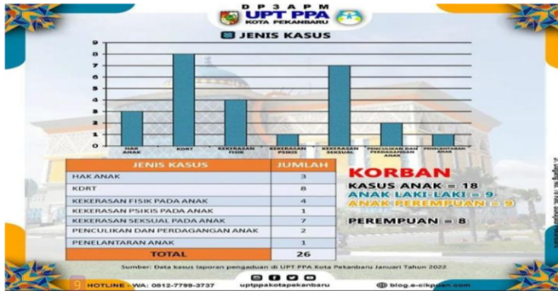
Figure 3. Types of Sexual Violence Complaints Cases in Pekanbaru City in January 2022