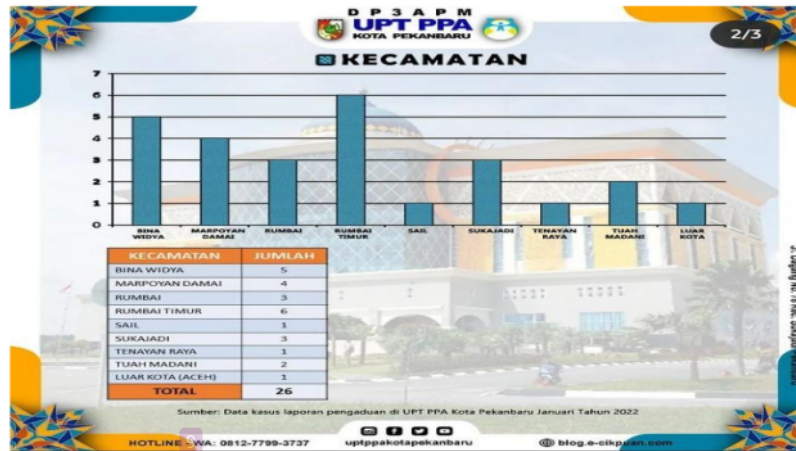
Figure 4. Locations of Sexual Violence Complaints Cases in Pekanbaru City in January 2022