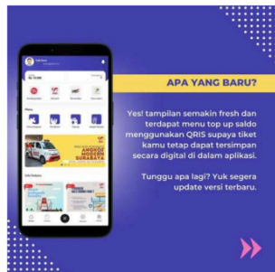
Figure 1. GoBis Suroboyo Service Poster

The city of Surabaya is leveraging digital technology to become a smart city, with one notable innovation being the GoBis (Golek Bis) application. This platform provides residents with easy access to real-time information about city buses, including their locations, routes, and schedules. The application's goal is to enhance the efficiency, convenience, and satisfaction of public transportation users. The Surabaya Transportation Agency (DISHUB) has recently expanded the GoBis application to include services beyond the Suroboyo Bus, now integrating the Trans East Java bus routes. This allows users to monitor various corridors, such as the Sidoarjo-Surabaya-Gresik route, making the application a more comprehensive tool for public transit information across the region. (Jawa Pos, 2023).